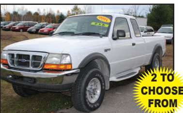
1999 FORD RANGER XLT 4x4, bedliner. Only 62K. SALE PRICE $7,499

989 VFW RD., CHEBOYGAN, MI • 231-627-6700 • WWW.RIVERAUTO.NET