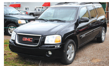
2002 GMC ENVOY XL