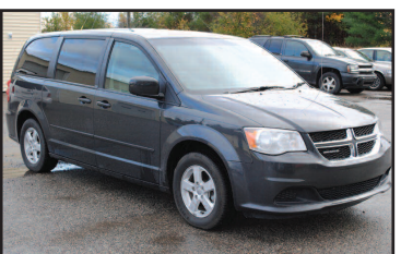
2011 DODGE GRAND CARAVAN Seats 7, 4 captain chairs, Stow-N-Go, power sliding doors, very nice. AS LOW AS $199 A MONTH