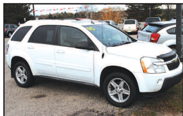
2005 CHEVY EQUINOX LT AWD, leather, moon roof. AS LOW AS $175 A MONTH