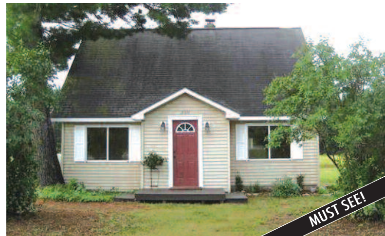
320 OLD STATE ROAD, BOYNE CITY • $114,990

Close to town but still far enough out of the way and off the main road. Many updates to home including a new 6" well in June 2013. MLS 438008. Ask for Mike Stark.