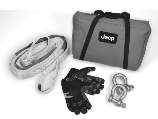
Among newest Mopar parts and accessories available for the Jeep Wrangler is the 2014 Trail Rated Kit, which includes a durable, high-quality tow strap and two heavy-duty D-rings. A pair of gloves is included for protection.

2014 Jeep Wrangler Trail Rated Kit: Strap it up and tow it along with this Trail Rated kit, which includes a durable, high-quality tow strap and two heavy-duty D-rings. A pair of gloves is included for protection and the kit is transported in an attractive Jeep carrying bag.