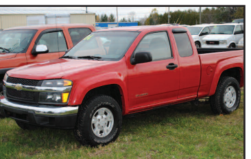
2004 CHEVY COLORADO Z-71 4WD, ext cab, bedliner, hitch. Nice. Sale PRICE $7,995