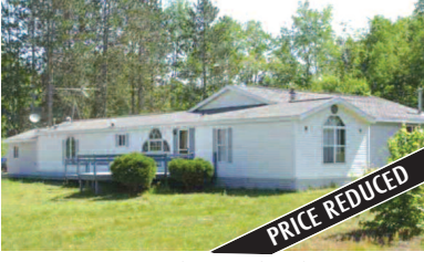
06834 FAIR ROAD, EAST JORDAN Well maintained mobile with two large additions. Includes 30 x 30 detached garage and a 30 x 30 pole building on 13+ acres! MLS 434955. Ask for Jennifer Burr. $63,000

This 4 bedroom home has been newly remodeled. Home is within walking distance to schools and parks, has new flooring throughout and has been freshly painted. This home is all ready for a new family to make it their home. MLS 438295. Ask for Holly Nierman.