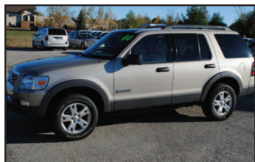
2006 FORD EXPLORER 4x4, Advanced Trac, tow pkg. Nice. AS LOW AS $199 A MONTH