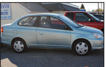
2003 TOYOTA ECHO 5 speed, air, great MPG. AS LOW AS $149 A MONTH