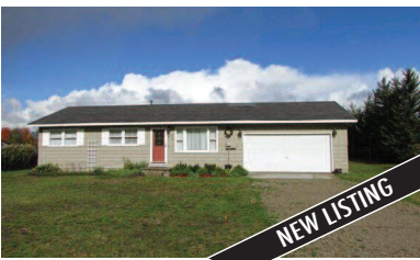
923 S INTERMEDIATE LAKE, CENTRAL LAKE Squeaky clean home with a spacious backyard! 2-car garage. A short walk to all-sports Intermediate Lake public access! MLS 438787. Ask for Mike Stark. $87,500