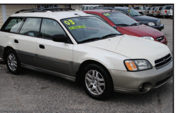
2003 SUBARU OUTBACK AWD, high miles. SALE PRICE $3,995