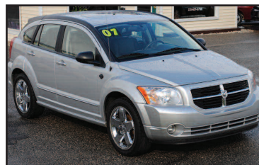
2007 DODGE CALIBER R/T AWD, Harley Davidson pkg, power moon roof, leather. Very nice and great MPG. AS LOW AS $179 A MONTH