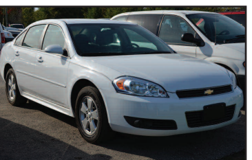
2011 CHEVY IMPALA Air, cruise, nice car. 29 MPG. AS LOW AS $225 A MONTH