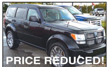
2011 DODGE NITRO Heat package, 4x4. AS LOW AS $249 A MONTH