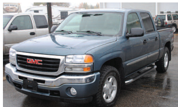
2006 GMC SIERRA