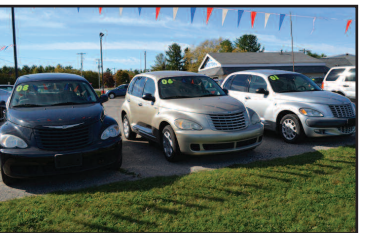
CHRYSLER PT CRUISERS 3 to choose from. Nice cars at a low price! AS LOW AS $149 A MONTH