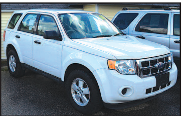
2010 FORD ESCAPE AWD, air, cruise, very nice. AS LOW AS $249 A MONTH