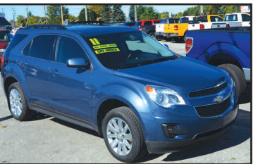
2011 CHEVY EQUINOX LT. AWD Very nice. AS LOW AS $249 A MONTH