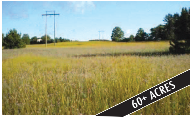
TBD MILES ROAD, EAST JORDAN 60+ acres of prime hunting property with road frontage on Miles and Nelson Rds. Ranney Creek flows through the property. MLS 436383. Ask for Jennifer Burr. $155,000