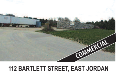
112 BARTLETT STREET, EAST JORDAN Commercial property right in town with a convenient location. Zoned C2, currently used as a trucking yard. Driveway in place. MLS 436755. Ask for Jennifer Burr. $38,900