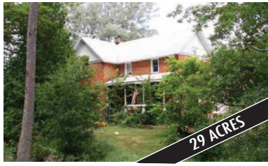
8465 ROGERS ROAD, EAST JORDAN Brick two story farmhouse 4BR and barn on 29 acres on Rogers Road. Mostly wooded with 2 babbling sandy bottom streams. MLS 437884. Ask for Holly Nierman $109,000

Close to town but still far enough out of the way and off the main road. Many updates to home including a new 6" well in June 2013. MLS 438008. Ask for Mike Stark.