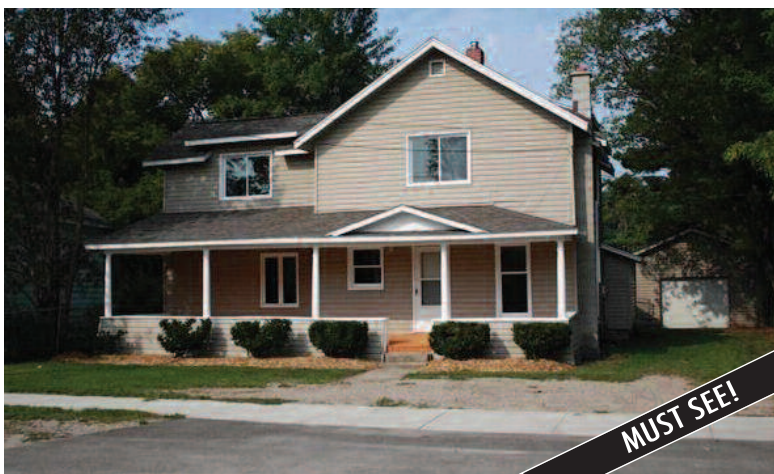
308 MAPLE • EAST JORDAN • $79,900