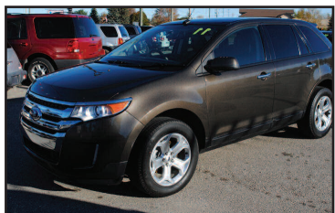
2011 FORD EDGE SEL AWD, leather, navigation. AS LOW AS $229 A MONTH