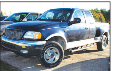
2001 FORD F-150 LARIAT 4x4, tow pkg, bedliner, sport side bed, ext cab, leather. AS LOW AS $155 A MONTH