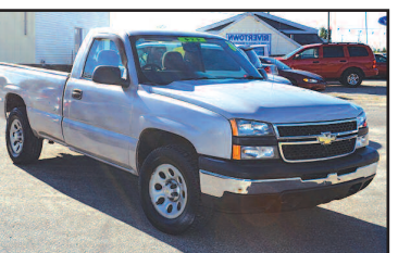
2006 CHEVY SILVERADO 4x4, tow pkg, bedliner. AS LOW AS $199 A MONTH