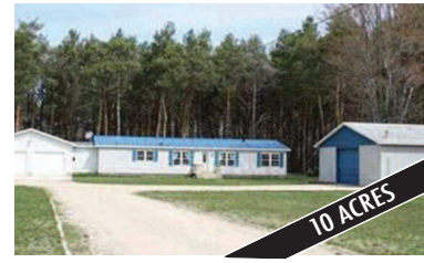
6721 FAIR ROAD, EAST JORDAN Located on 10 acres close to town, beautiful master suite, plus 2 car attached garage with a bonus 28x32 out building. MLS 436868. Ask for Holly Nierman. $112,900