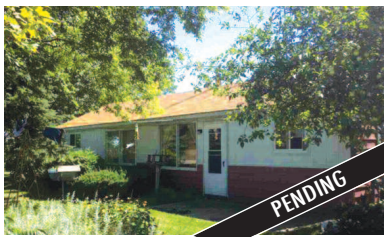
07748 ROGERS ROAD, EAST JORDAN This stick built home is in a great location close to town. Two beds, with the possibility of a third. Fenced back yard. MLS 438405. Ask for Chris Oliver $59,000