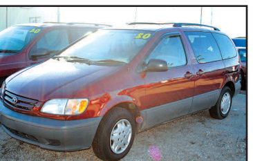
2002 TOYOTA SIENNA 7 Passenger van, dual sliding doors, air, cruise. AS LOW AS $189 A MONTH