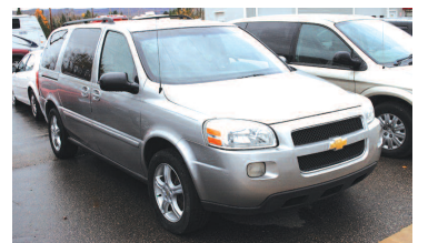
2005 CHEVY UPLANDER