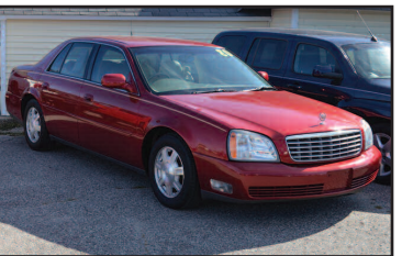
2004 CADILLAC DEVILLE Leather and loaded. It's a Cadillac. AS LOW AS $189 A MONTH