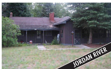
2452 MARTINSON DRIVE., EAST JORDAN Fantastic location with access to the river and snowmobile trails. Beautiful frontage on the famed Jordan River. Pole barn for extra storage. MLS 435491. Ask for Mike Stark. $159,900.