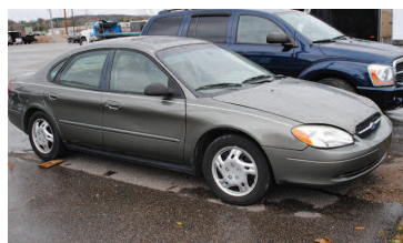
2002 FORD TAURUS