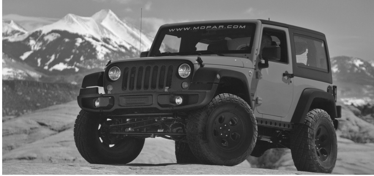
The Jeep® Wrangler was recognized as the "Hottest 4x4-SUV" for a fourth consecutive year at the 2013 Specialty Equipment Market Association (SEMA) trade show in Las Vegas.