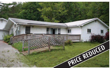
933 E OLD STATE ROAD, EAST JORDAN 3BR, 1.5BA on 27 wooded and rolling acres. Here's your chance to put your personal touches on a home with acreage. MLS 437970. Ask for Holly Nierman. $59,999