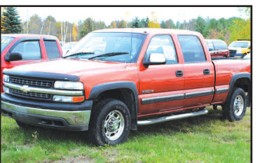
2001 CHEVY SILVERADO 1500 HD 4x4, ext cab, 4 door, bedliner, tow pkg. SALE PRICE $7,995