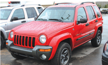
2004 JEEP LIBERTY