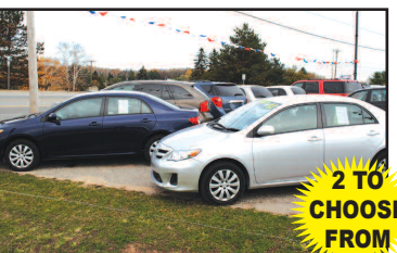
2012 TOYOTA COROLLA LE Your Choice, $13,499. AS LOW AS $199 A MONTH